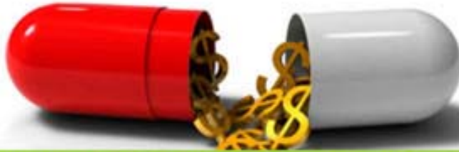
Rock Island County Discount Rx Program

and the card pick-up locations at various Rock Island County pharmacies and County Departments. Residents may also print a card from the website. About The program is administered by Financial Marketing Concepts, Inc., owner of the Coast2Coast Rx Card. Data Collection: Cardholder information remains confidential and is not resold to a third-party for any reason.